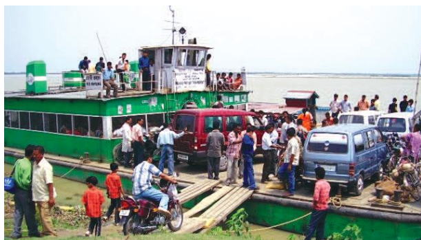
Fig. 7.5: Inland waterways widely used in north-eastern states