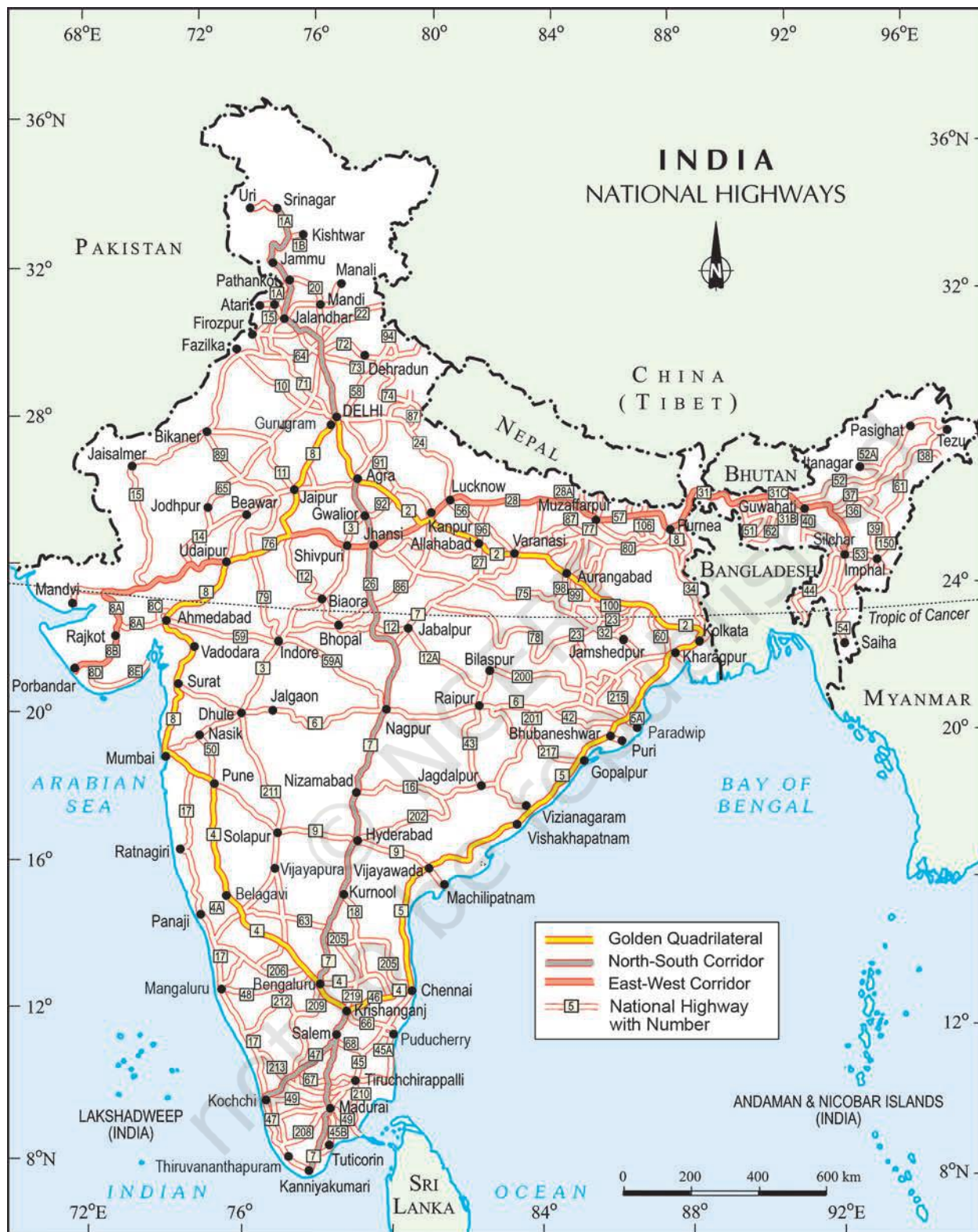
India: National Highways