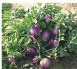
Fig. 4.13: Cultivation of vegetables – peas, cauliflower, tomato and brinjal

Source: Pocket book of agricultural statistics, 2020, Govt. of India. Directorate of Economics and Statistics.