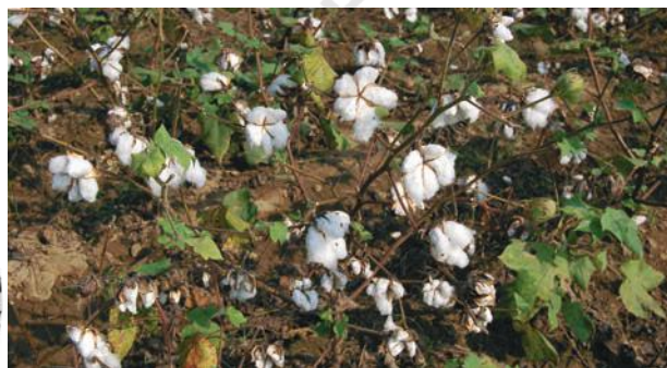
Fig. 4.14: Cotton Cultivation

The laws of land reforms were enacted but the implementation was lacking or lukewarm. The Government of India embarked upon introducing agricultural reforms to improve Indian agriculture in the 1960s and 1970s. The Green Revolution based on the use of package technology and the White Revolution (Operation Flood) were some of the strategies initiated to improve the lot of Indian agriculture. But, this too led to the concentration of development in few selected areas. Therefore, in the 1980s and 1990s, a comprehensive land development programme was initiated, which included both institutional and technical