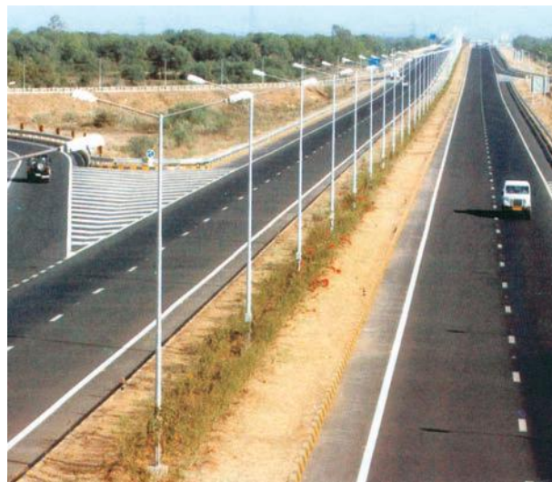
Fig.7.2: Ahmedabad- Vadodara Expressway