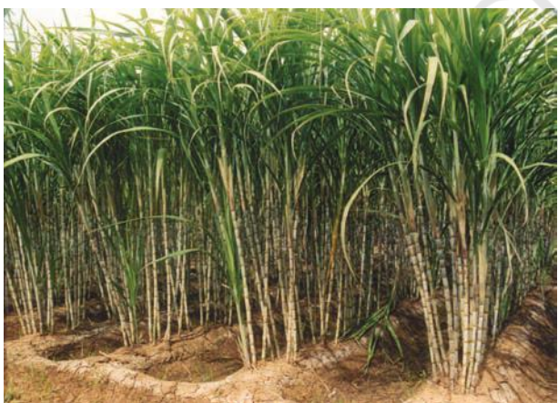
Fig. 4.8: Sugarcane Cultivation

Sugarcane: It is a tropical as well as a subtropical crop. It grows well in hot and humid climate with a temperature of 21°C to 27°C and an annual rainfall between 75cm. and 100cm. Irrigation is required in the regions of low rainfall. It can be grown on a variety of soils and needs manual labour from