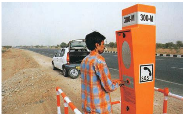
Fig.7.10 : Emergency call box on NH-8

Digital India is an umbrella programme to prepare India for a knowledge based transformation. The focus of Digital India Programme is on being transformative to realise – IT (Indian Talent) + IT (Information Technology)=IT (India Tomorrow) and is on making technology central to enabling change.