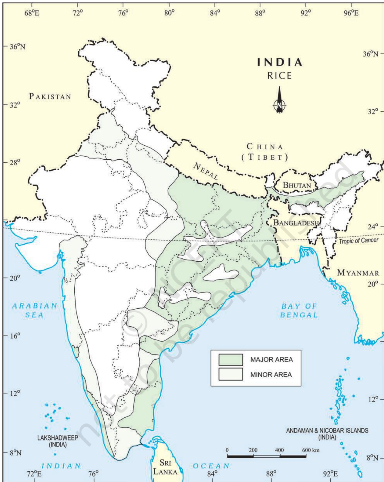
India: Distribution of Rice