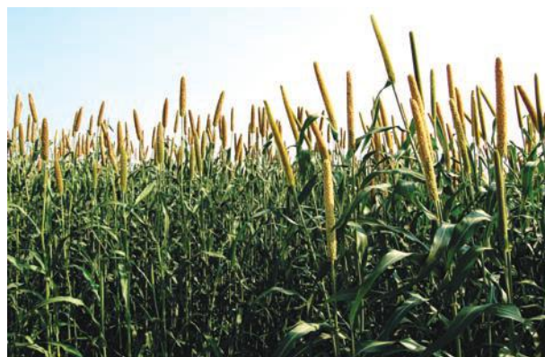
Fig. 4.6: Bajra Cultivation

Bajra grows well on sandy soils and shallow black soil. Major Bajra producing States are Rajasthan, Uttar Pradesh, Maharashtra, Gujarat and Haryana. Ragi is a crop of dry regions and grows well on red, black, sandy, loamy and shallow black soils. Major ragi producing states are: Karnataka, Tamil Nadu, Himachal Pradesh, Uttarakhand, Sikkim, Jharkhand and Arunachal Pradesh.