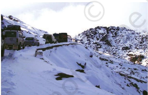
Fig. 7.4: Traffic on north-eastern border road (Arunachal Pradesh)

Roads can also be classified on the basis of the type of material used for their construction such as metalled and unmetalled roads. Metalled roads may be made of cement, concrete or even bitumen of coal, therefore,