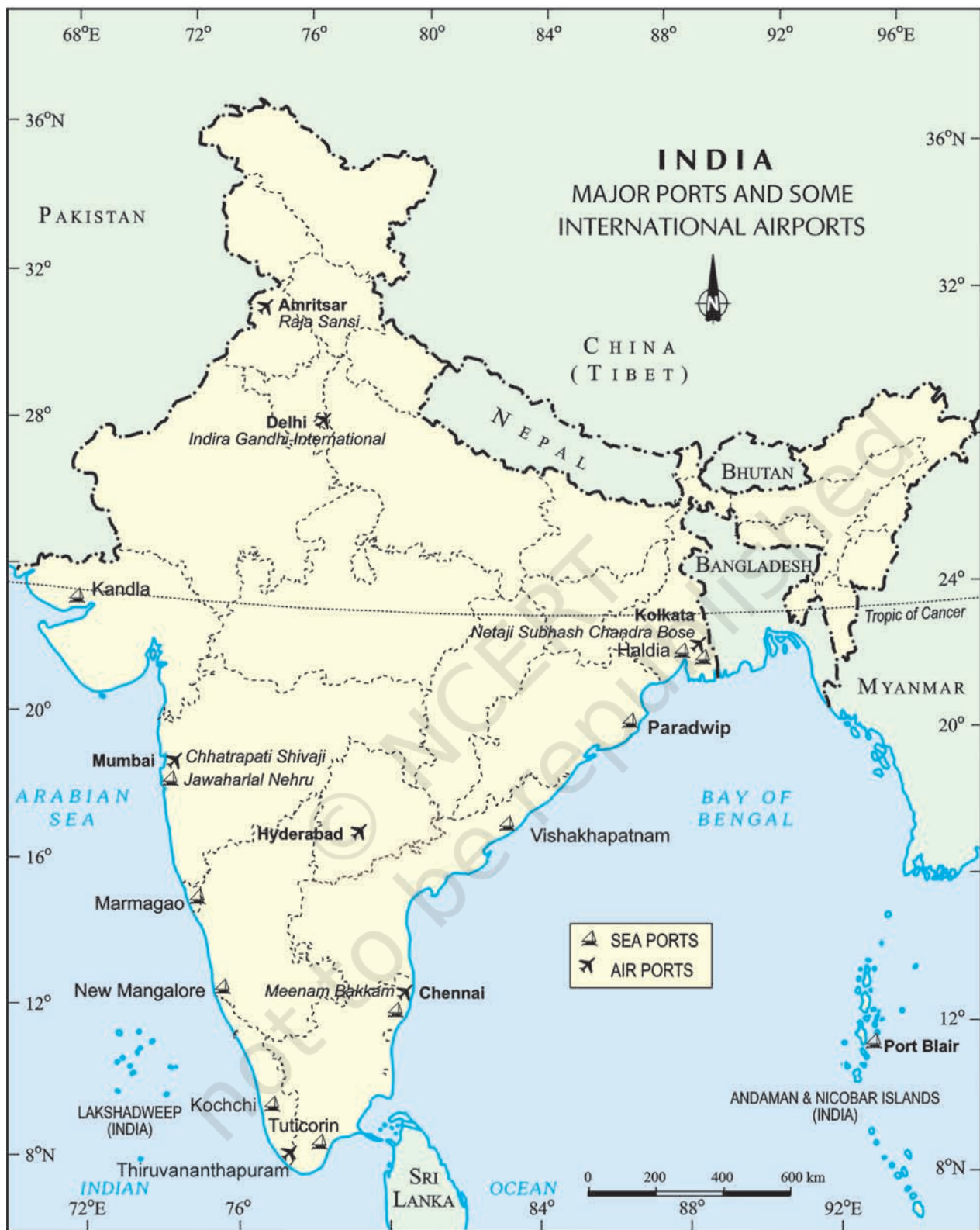
India: Major Ports and Some International Airports