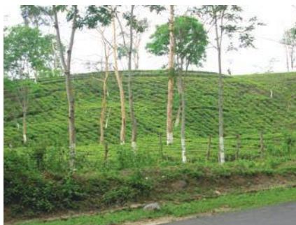
Fig. 4.10: Tea Cultivation

Coffee: Indian coffee is known in the world for its good quality. The Arabica variety initially brought from Yemen is produced in the country. This variety is in great demand all over the world. Initially its cultivation was introduced on the Baba Budan Hills and even today its cultivation is confined to the Nilgiri in Karnataka, Kerala and Tamil Nadu.