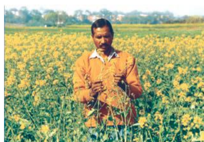
Fig. 4.9: Groundnut, sunflower and mustard are ready to be harvested in the field