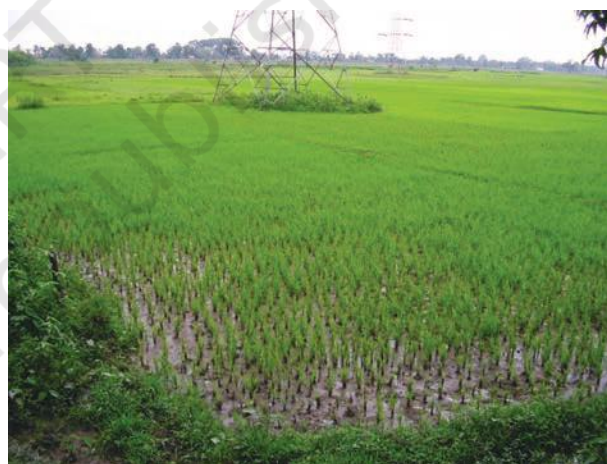
Fig. 4.4 (a): Rice Cultivation

Rice: It is the staple food crop of a majority of the people in India. Our country is the second largest producer of rice in the world after China. It is a kharif crop which requires high temperature, (above 25°C) and high humidity with annual rainfall above 100 cm. In the areas of less rainfall, it grows with the help of irrigation.