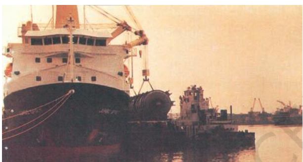
Fig. 7.8: Handling of oversize cargo at Tuticorin port

even our neighbouring countries like Sri Lanka, Maldives, etc. and the coastal regions of India. Chennai is one of the oldest artificial ports of the country. It is ranked next to Mumbai in terms of the volume of trade and cargo. Vishakhapatnam is the deepest landlocked and well-protected port. This port was, originally, conceived as an outlet for iron ore exports. Paradwip port located in Odisha, specialises in the export of iron ore. Kolkata is an inland riverine port. This port serves a very large and rich hinterland of Ganga-Brahmaputra basin. Being a tidal port, it requires constant dredging of Hoogly. Haldia port was developed as a subsidiary port, in order to relieve growing pressure on the Kolkata port.