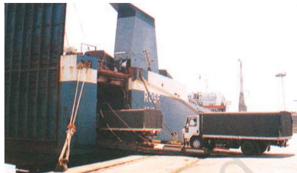
Fig. 7.6: Trucks being driven into the vessel at Mumbai port

Deendayal Port, is a tidal port. It caters to the convenient handling of exports and imports of highly productive granary and industrial belt stretching across UT of Jammu and Kashmir, and the states of Himachal Pradesh, Punjab, Haryana, Rajasthan and Gujarat.