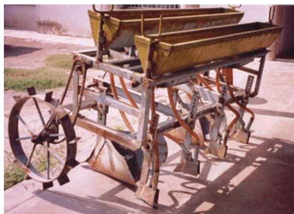
Fig. 4.15: Modern technological equipments used in agriculture

reforms. Provision for crop insurance against drought, flood, cyclone, fire and disease, establishment of Grameen banks, cooperative societies and banks for providing loan facilities to the farmers at lower rates of interest were some important steps in this direction.