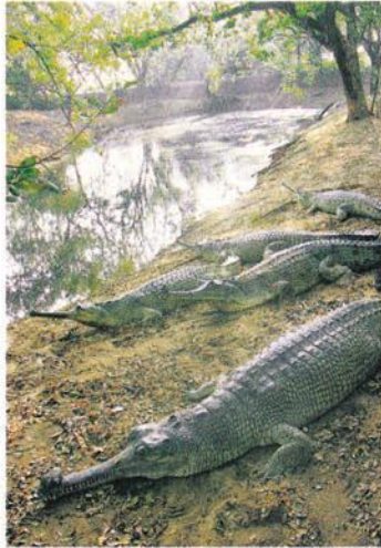
CRITICALLY ENDANGERED: Captive gharial at the Madras C

W ISPY tendrils of mist rise delicately from the water surface, tinged gold by the dawn. Your breath hangs as little clouds of vapour as you gaze upon the Girwa River on a cold winter morning. A trio of hollow clapping sounds from the other side of the river, half a kilometre away tells you that an adult male gharial is advertising his presence. It is the height of the breeding season. The place seems trapped in a time in early history when man was still clad in animal skins. It is only as the sun rises higher and burns the mist off the water that the world comes into focus with appalling clarity. The five-km stretch of the Girwa River in Katarniaghat Wildlife Sanctuary is one of the only three wild breeding sites left in the world for the most unique of all the