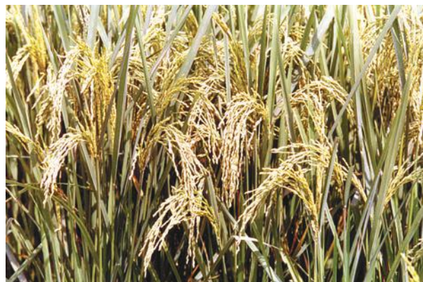
Fig. 4.4 (b): Rice is ready to be harvested in the field