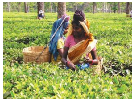
Fig. 4.11: Tea-leaves Harvesting

Horticulture Crops: In 2018, India was the second largest producer of fruits and vegetables in the world after China. India is a producer of tropical as well as temperate fruits. Mangoes of Maharashtra, Andhra Pradesh, Telangana, Uttar Pradesh and West Bengal, oranges of Nagpur and Cherrapunjee (Meghalaya), bananas of Kerala, Mizoram, Maharashtra and Tamil Nadu, lichi and guava of Uttar Pradesh and Bihar, pineapples of Meghalaya, grapes of Andhra Pradesh, Telangana and Maharashtra, apples, pears, apricots and walnuts of Jammu and Kashmir and Himachal Pradesh are in great demand the world over.