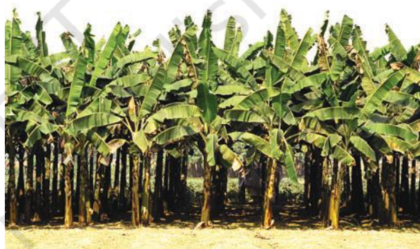
Fig. 4.2: Banana plantation in Southern part of India

In India, tea, coffee, rubber, sugarcane, banana, etc., are important plantation crops. Tea in Assam and North Bengal coffee in Karnataka are some of the important plantation crops grown in these states. Since the production is mainly for market, a well-developed network of transport and communication connecting the plantation areas, processing industries and markets plays an important role in the development of plantations.