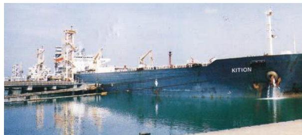
Fig. 7.7: Tanker discharging crude oil at New Mangalore port

Mumbai is the biggest port with a spacious natural and well-sheltered harbour. The Jawaharlal Nehru port was planned with a view to decongest the Mumbai port and serve as a hub port for this region. Marmagao port (Goa) is the premier iron ore exporting port of the country. This port accounts for about fifty per cent of India's iron ore export. New Mangalore port, located in Karnataka caters to the export of iron ore concentrates from Kudremukh mines. Kochchi is the extreme south-western port, located at the entrance of a lagoon with a natural harbour.