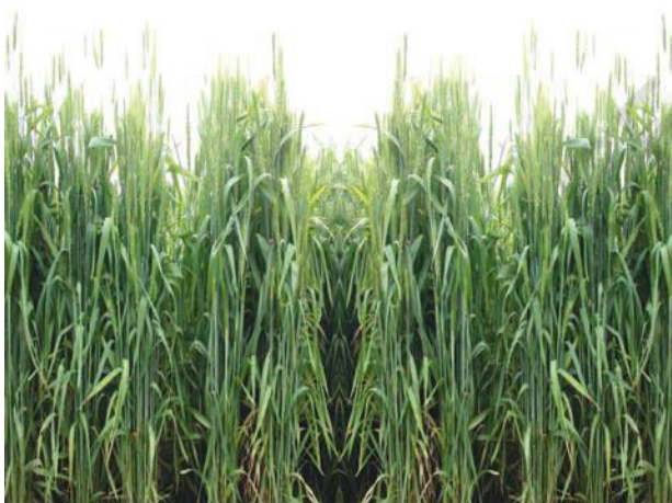
Fig. 4.5: Wheat Cultivation

Wheat: This is the second most important cereal crop. It is the main food crop, in north and north-western part of the country. This rabi crop requires a cool growing season and a bright sunshine at the time of ripening. It requires 50 to 75 cm of annual rainfall evenly-distributed over the growing season. There are two important wheat-growing zones in the country – the Ganga-Satluj plains in the north-west and black soil region of the Deccan. The major wheat-producing states are Punjab, Haryana, Uttar Pradesh, Madhya Pradesh, Bihar and Rajasthan.