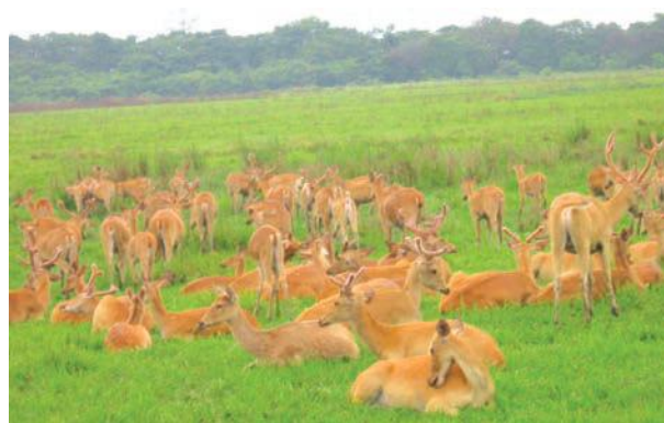
Fig. 2.2: Rhino and deer in Kaziranga National Park

equal importance as a means of preserving biotypes of sizeable magnitude. Corbett National Park in Uttarakhand, Sunderbans National Park in West Bengal, Bandhavgarh National Park in Madhya Pradesh, Sariska Wildlife Sanctuary in Rajasthan, Manas Tiger Reserve in Assam and Periyar Tiger Reserve in Kerala are some of the tiger reserves of India.