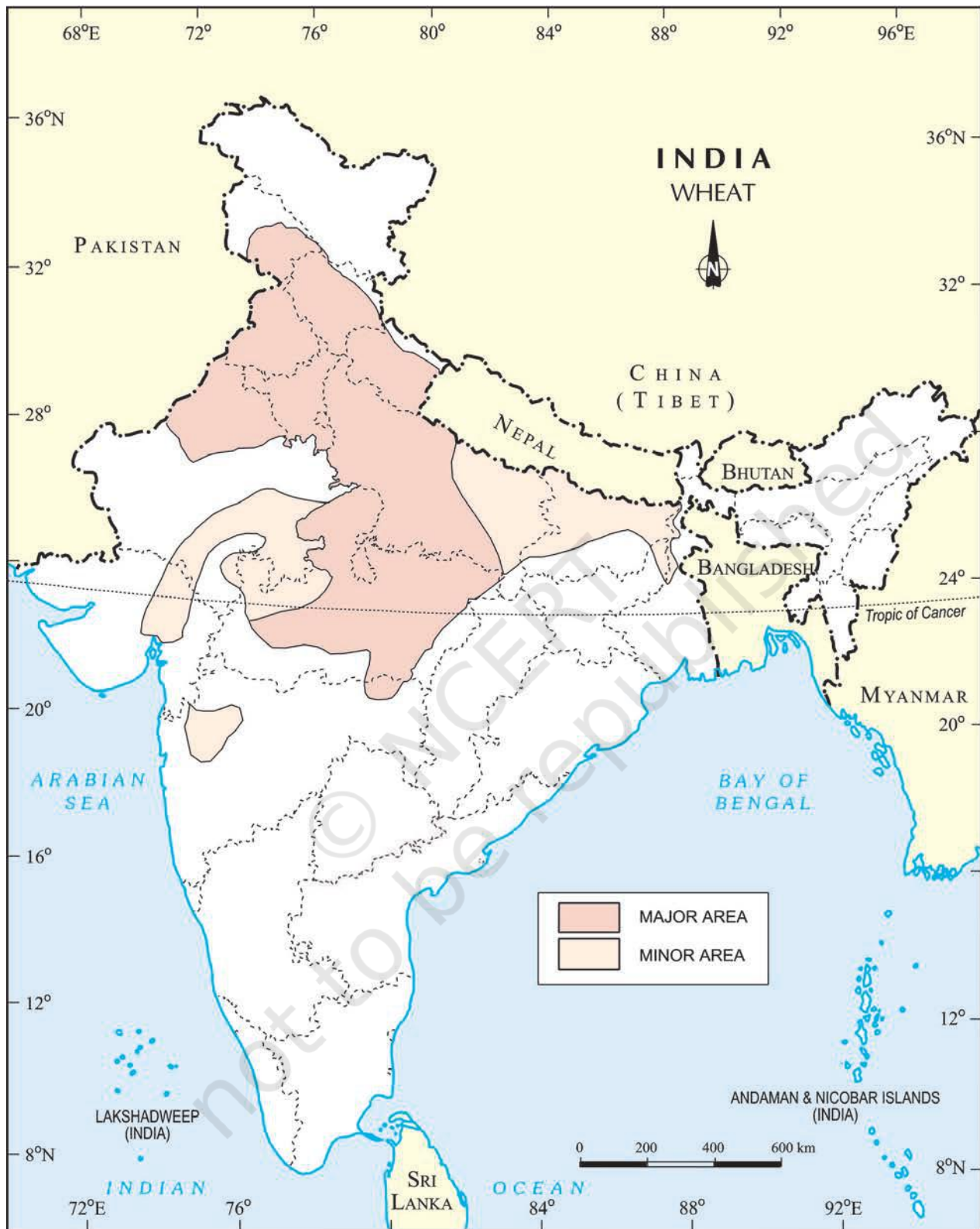
India: Distribution of Wheat