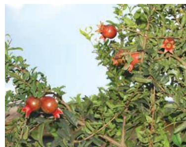
Fig. 4.12: Apricots, apple and pomegranate