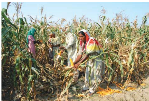
Fig. 4.7: Maize Cultivation

Maize: It is a crop which is used both as food and fodder. It is a kharif crop which requires temperature between 21°C to 27°C and grows well in old alluvial soil. In some states like Bihar maize is grown in rabi season also. Use of modern inputs such as HYV seeds, fertilisers and irrigation have contributed to the increasing production of maize. Major maize-producing states are Karnataka, Madhya Pradesh, Uttar Pradesh, Bihar, Andhra Pradesh and Telangana.